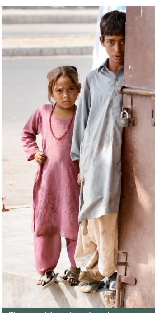
> The poor and the needy are those who cannot meet their basic needs.

Regarding the deserving beneficiaries of zakaat , the Qur'an states, " Zakaat is for the poor, the destitute, those who collect it, those whose hearts are to be reconciled, for those in debt, for the cause of Allah and the stranded travellers. It is a legal obligation from Allah. Allah is All-Knowing, All-Wise." ( Soorat At - Tawbah , 9:60)