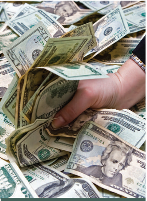
> Love of wealth is an innate human tendency, and Islam requires its followers not to be obsessively attached to wealth and to pay zakaat in order to purify their hearts from selfish greed.